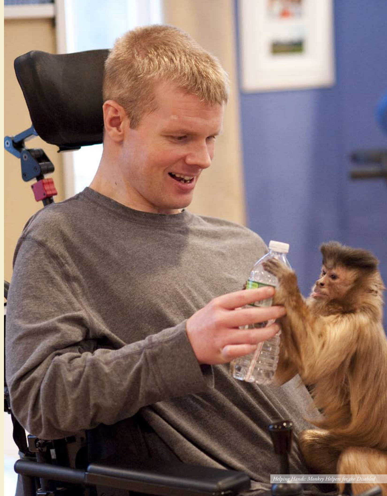
Helping Hands: Monkey Helpers for the Disabled

To support the Job Training & Employment program for people with disabilities in the Boston area.